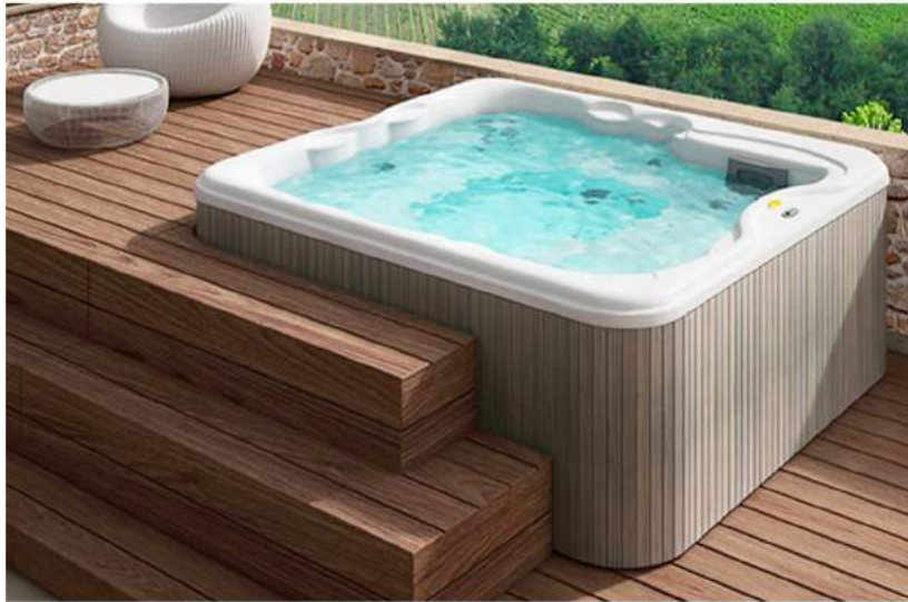
JACUZZI FOR DUPLEX TERRACES