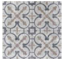
Imitation of Baldosa Hidraulica